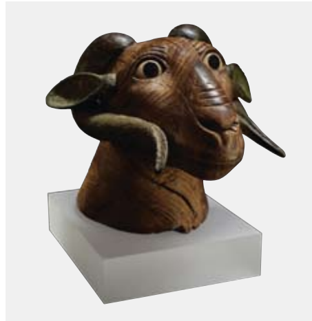
4 Head of a ram Egyptian 25th–26th dynasty Wood, bronze and stone 15.4×19.5×17.2cm Collection of the Fondation Gandur pour l'Art © Sandra Pointet